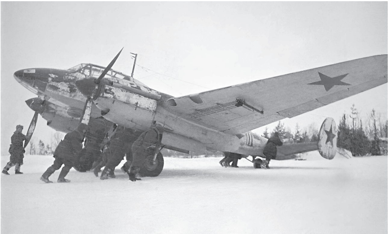
A Soviet Pe-2 bomber after a combat mission. Note the dive brakes under the wing and the open bomb bays.

The main weakness in VVS Northwestern Front was its capacity to strike ground targets in daylight. At the start of the year, it only had one under-equipped Shturmovik regiment, 288 ShAP. This was joined by 299 ShAP and 502 ShAP, which entered combat on January 12, but with only a handful of Il-2s. These three regiments carried out an average of less than five sorties per day until the end of the month. The situation was not much better regarding bomber operations in daytime. VVS Northwestern Front had only one regiment for this purpose, 514 BAP, and its Pe-2s carried out an average of only eight combat sorties per day between January 7 and 31. 19 Thus, most air attacks against ground targets—German troop concentrations, supply columns and depots, airfields, and occupied settlements—were carried out by single-engine light bomber biplanes at nighttime and strafing fighters in daytime.