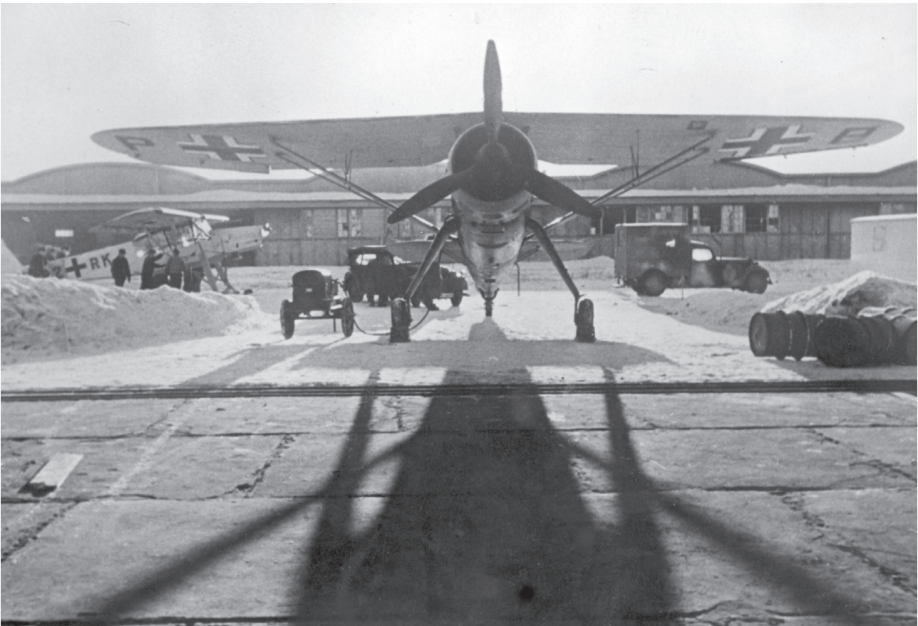
A Hs 126 of 2.(H)/21 with a Fi 156 Storch and the Soviet-constructed hangars at Siverskaya Airdrome in the background. With 4.(H)/23 operating in the area south of Lake Ilmen, this was the only German tactical reconnaissance Staffel in the Leningrad – Volkhov area in early 1942. In February 1942, this Staffel had two Hs 126s shot down and lost three more to technical failures.