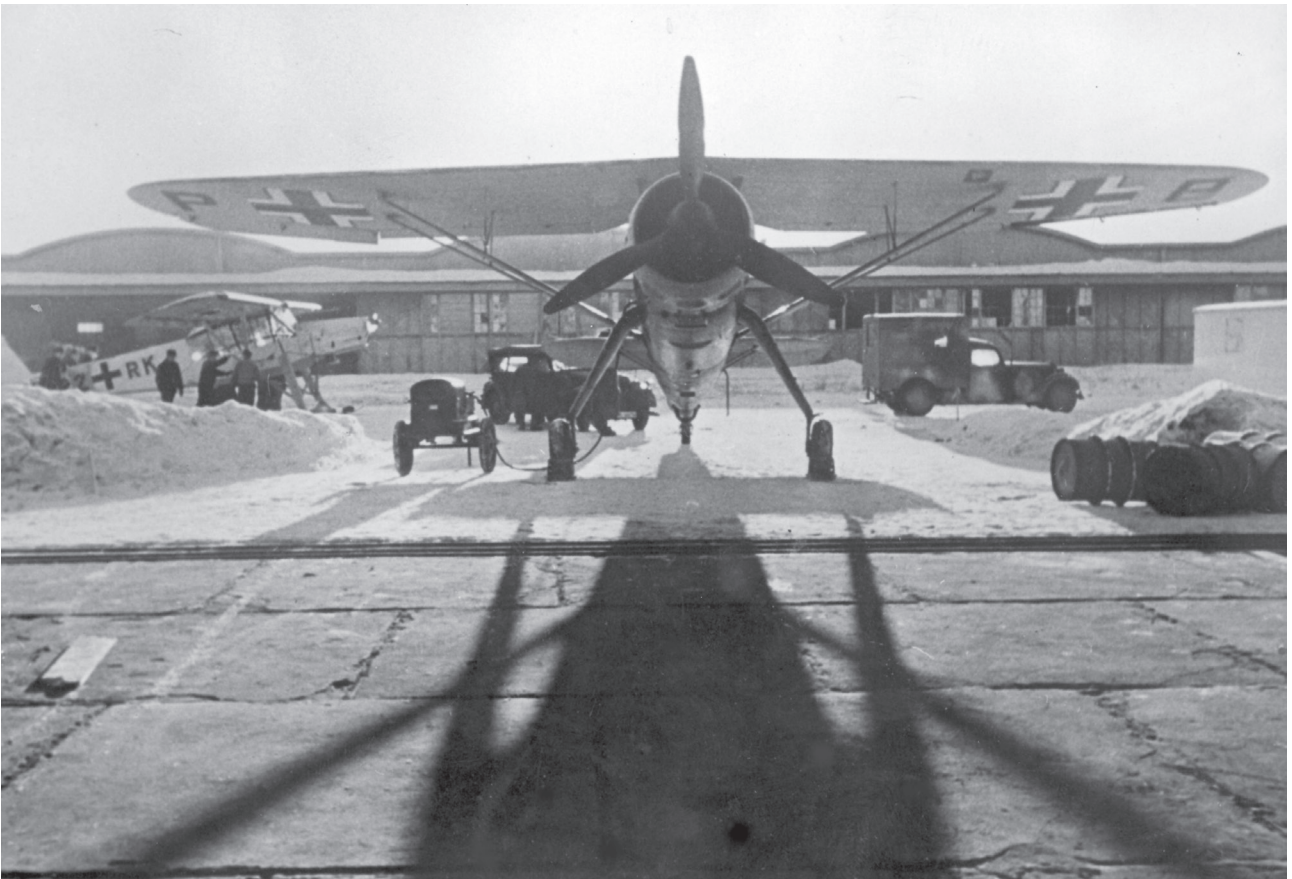
A Hs 126 of 2.(H)/21 with a Fi 156 Storch and the Soviet-constructed hangars at Siverskaya Airdrome in the background. With 4.(H)/23 operating in the area south of Lake Ilmen, this was the only German tactical reconnaissance Staffel in the Leningrad – Volkhov area in early 1942. In February 1942, this Staffel had two Hs 126s shot down and lost three more to technical failures.